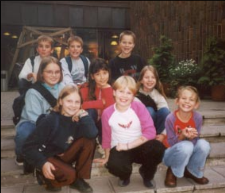
Suomi-koululaisia Hampurin merimieskirkolla.