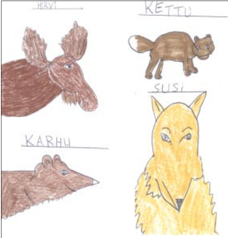
Lasten piirtämiä suomalaisia eläimiä.

Monet suomalaiset ovat kokeneet tarpeelliseksi jatkuvan yhteydenpidon Suomeen. Isovanhempien tapaaminen ja lasten tutustuttaminen toisen vanhemman kotimaaan ja sen luontoon ovat tärkeimpiä syitä toistuviin Suomen matkoihin. Lapsille Suomi on ennen kaikkea loman, mummolan ja mökkeilyn maa, jossa on puhdasta luontoa, tilaa ja vapautta.