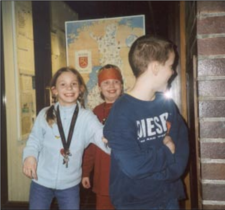
Saksansuomalaisia lapsia leikkimässä vettä kengässä -leikkiä Suomi-koululla.

lainen puoli; mie piän siellä on enemmän metsiä, rantaa ja vettä, joka ei oo niin likanen, se vesi. (Rosa)