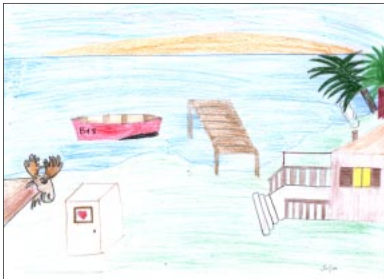
Lapsen piirros suomalaisesta mökkimaisemasta.